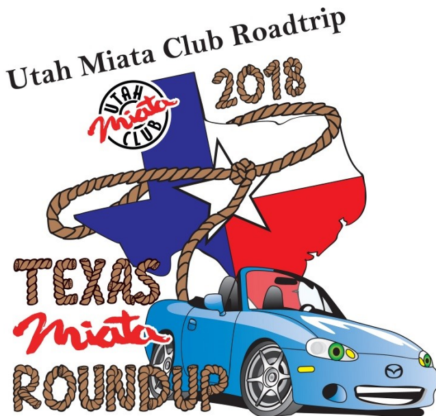
Front of shirt